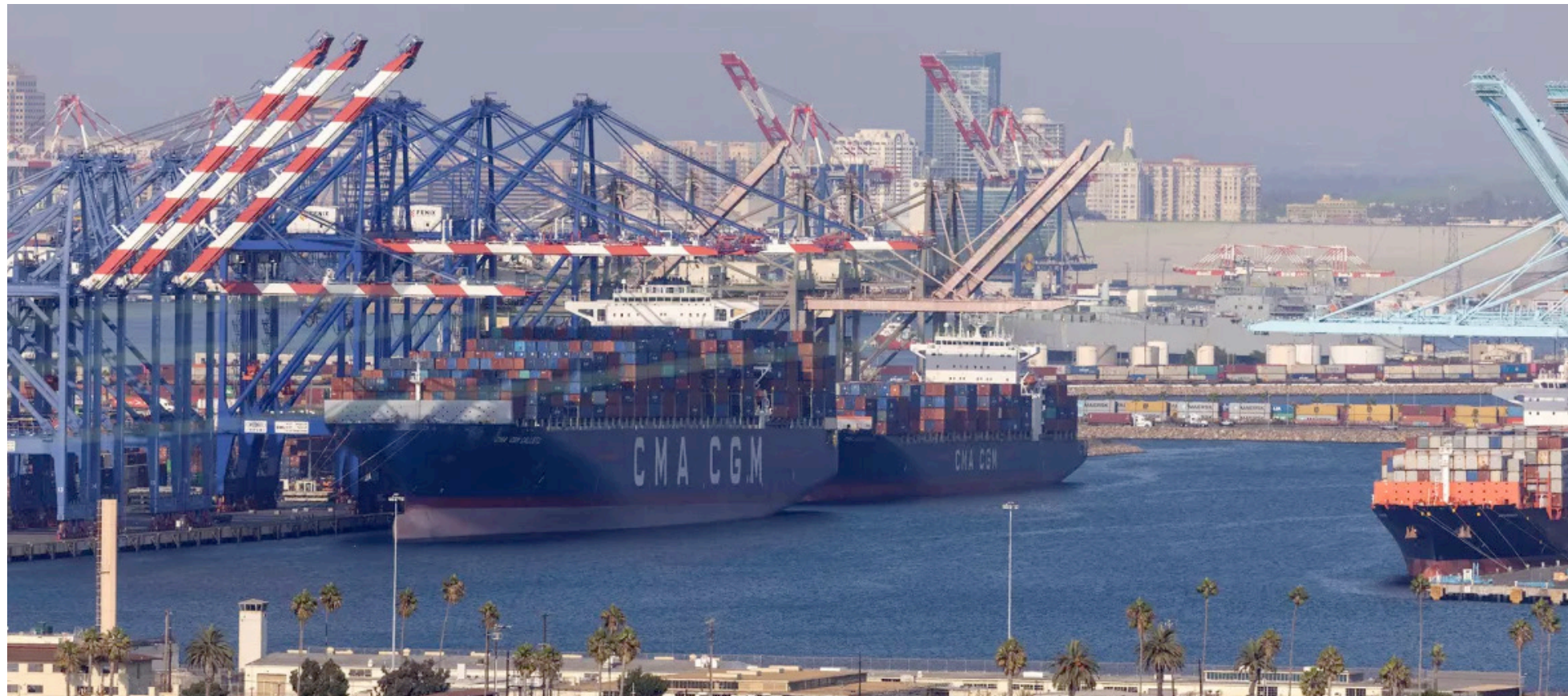
The Port of Los Angeles in San Pedro on Sept. 29, 2021.

[ Article originally appeared on www.calmatters.org ]